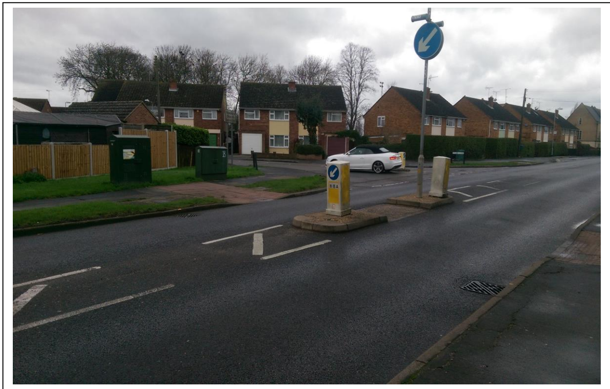
Current refuge crossing view in Crossing Road