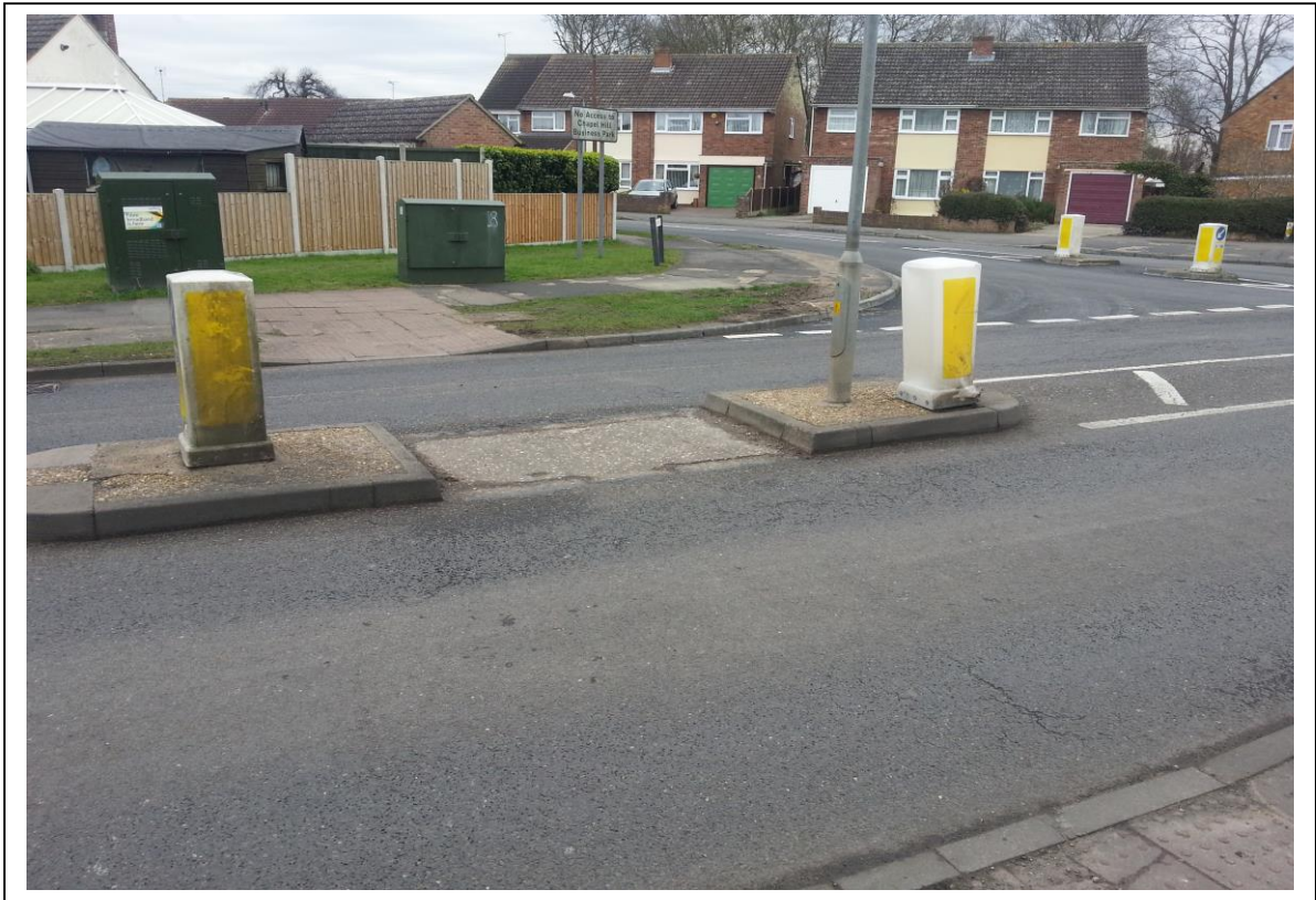
Current refuge crossing view in Crossing Road